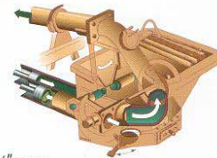
C-Valve B2314 8" to 8" (200 to 140mm) Hopper capacity 14.1 cu ft (400L) Hopper height 53.5" (1360mm)