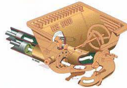
BSF • S-Valve Hopper RS905 S-Valve 2018 Hard Faced 8" to 7" (200 to 180mm) Hopper capacity 21.2 cu ft (600L) Hopper height 50.4" (1280mm)